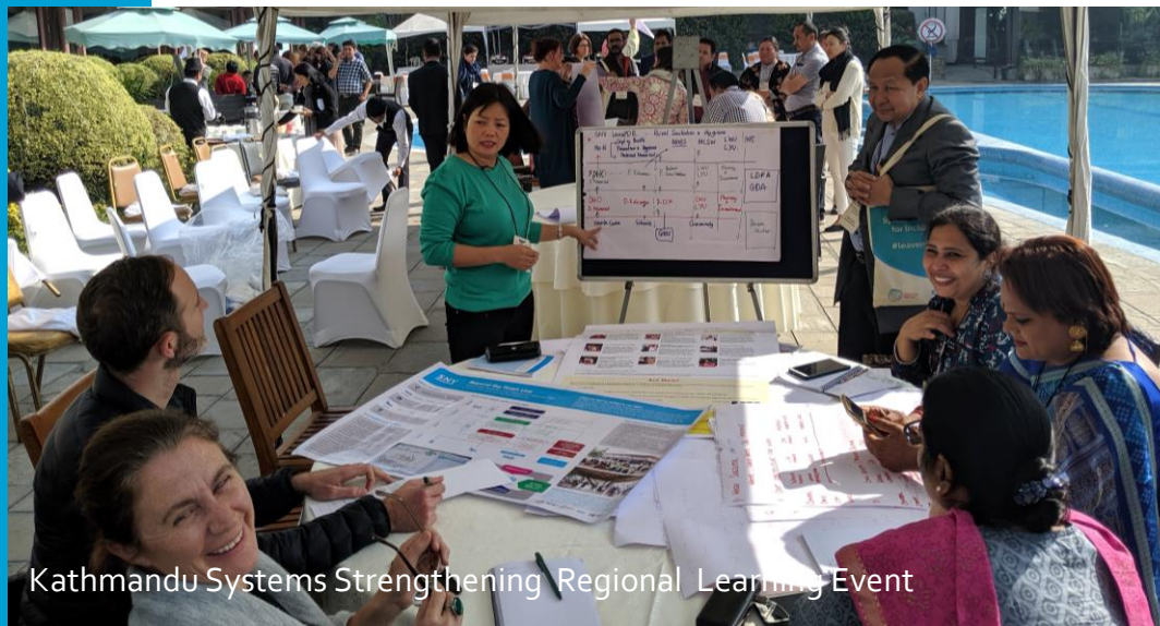
Kathmandu Systems Strengthening Regional Learning Event