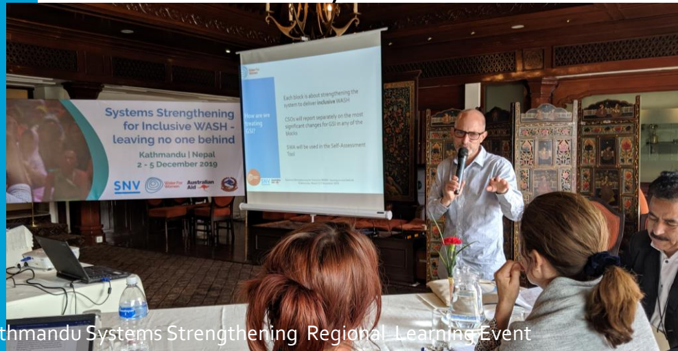
Kathmandu Systems Strengthening Regional Learning Event