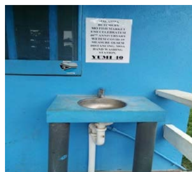
Figure 2a: Malampa Butchery and Fish Market; 2b: Close-up of handwashing station