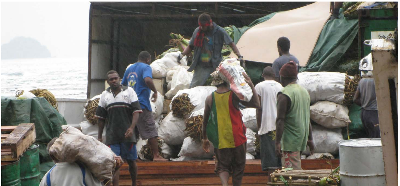
Kava being loaded onto MV Brisk, South West Bay