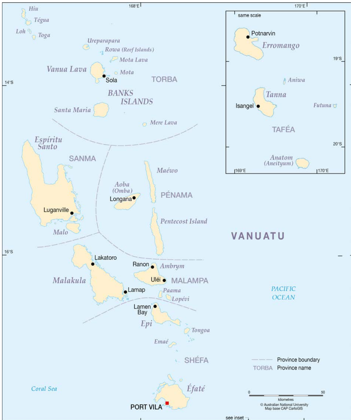
The Republic of Vanuatu and provinces